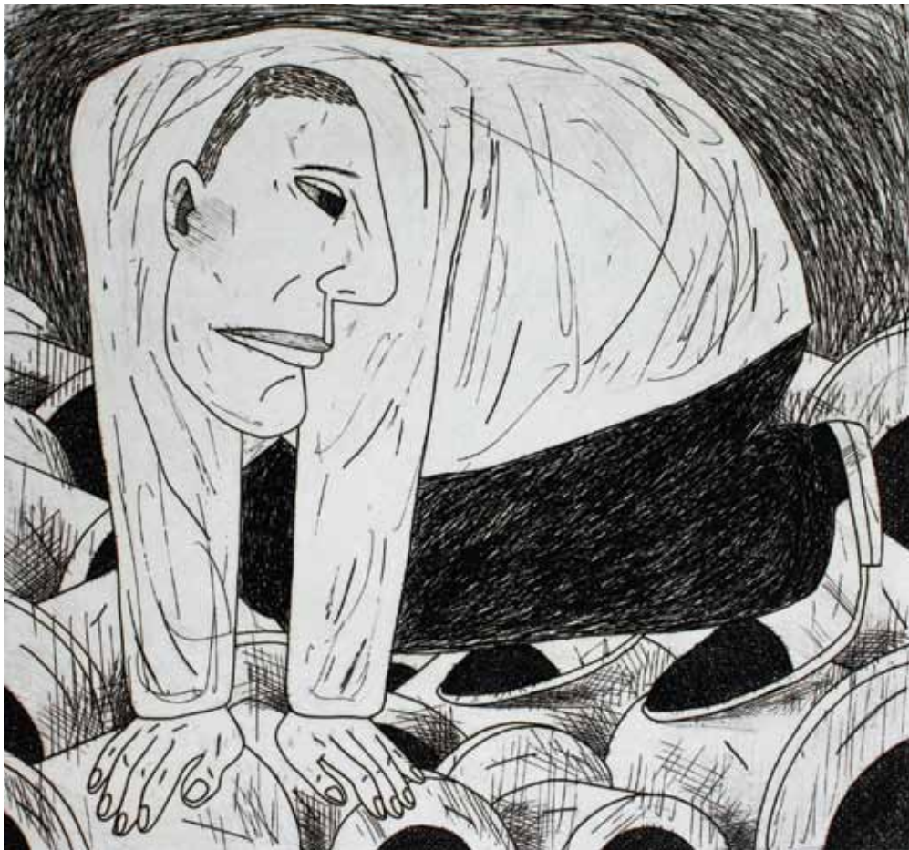
Euan Heng , Untitled , 1988, etching, 19 x 20.5 cm, printed by Anne McMaster as part of the Print Council of Australia's 100 x 100 Portfolio.

I: How did your time at sea shape your artistic style?