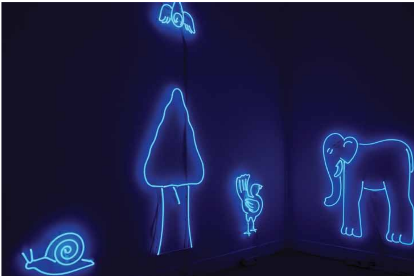
Euan Heng, E is for Elephant (installation), 2001, neon, various dimensions, Project Space RMIT.

etchings, the artist's book – things that you can handle. And I really like paper – I think paper is just the most beautiful stuff to work on. I'm also taken by how a print can evoke great visual power. I have never seen the print as something lesser than painting or sculpture – even a tiny wood engraving is just another way of exploring or expressing an idea visually. I'm not a big fan of the 'jumbo' print but there are exceptions. This is going to sound nostalgic but I still get a buzz when I peel back the paper from the plate or block – it's magical. The multiple is important but I also consider the print in all its forms – books, posters and textiles, all of these will engage my interest and curiosity.